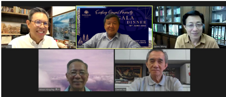
Meeting with HAAM Council of Reference on 19 May 2023