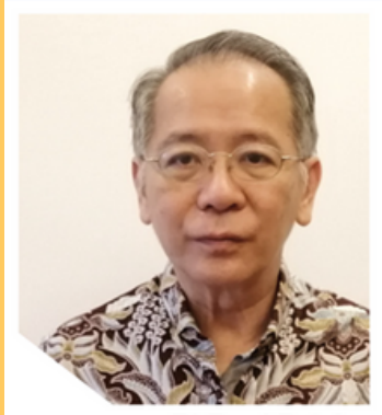
Right Reverend Datuk Ng Moon Hing

Archbishop of the Anglican Diocese of Southeast Asia